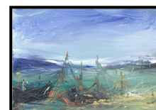
Images taken from 2012 Art Auction

THAT is a Scottish Charity which provides arts programmes for patients with long-term health conditions.