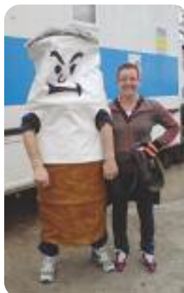
Right: Young people at The Corner in Dundee found out about the financial costs and health effects of smoking and received NSD freebies to help them with their quit plans.