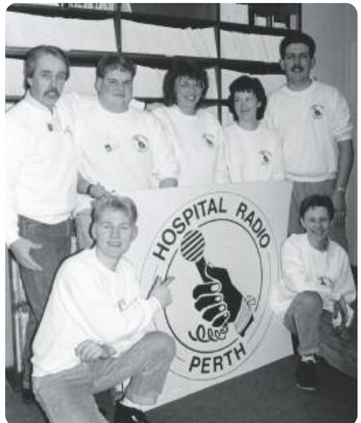
The first team in the old studio 20 years ago

Over the years Hospital Radio Perth has become one of the premiere hospital broadcasters in the UK, winning the UK Station Of The Year Award a record four times.