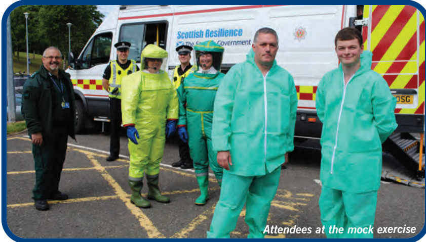
Attendees at the mock exercise

A multi-agency mock exercise to support readiness in the event of a contamination incident was held at Ninewells involving A&E, Police Scotland, Scottish Fire & Rescue, the Scottish Ambulance Service and the University of Dundee.