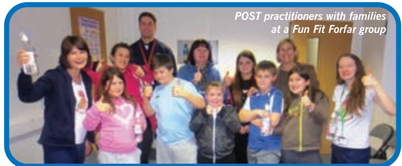
POST practitioners with families at a Fun Fit Forfar group

Over the last five years, more than 850 children and young people in Tayside with concerns about their weight have been referred to the service, with three quarters of these deciding to take part in the programme.