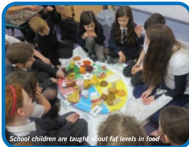
School children are taught about fat levels in food

The team now also promotes healthy eating and healthy weight to whole schools through the Fun Fit Tayside programme, which was developed in partnership with teachers. Over 5000 primary school pupils from 99 schools have taken part and a secondary school programme is ready to be tested out later this year.