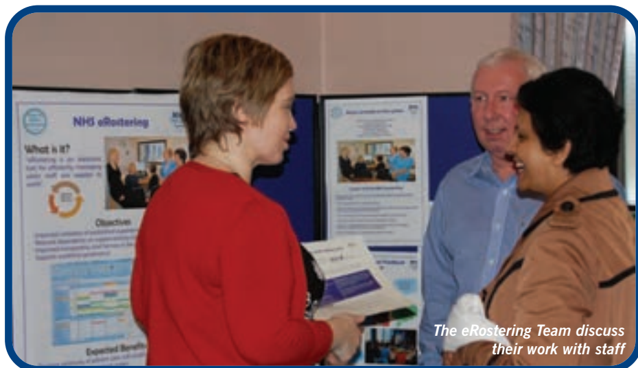
The eRostering Team discuss their work with staff

The projects, which are led by frontline staff, include Medicines Leadership, Procurement, Musculoskeletal Pathway, eRostering, Electronic Patient Record and Mental Health.