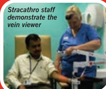
Stracathro staff demonstrate the vein viewer

Over the course of 2013, the Friends generously donated equipment worth over £131,000 to the hospital.