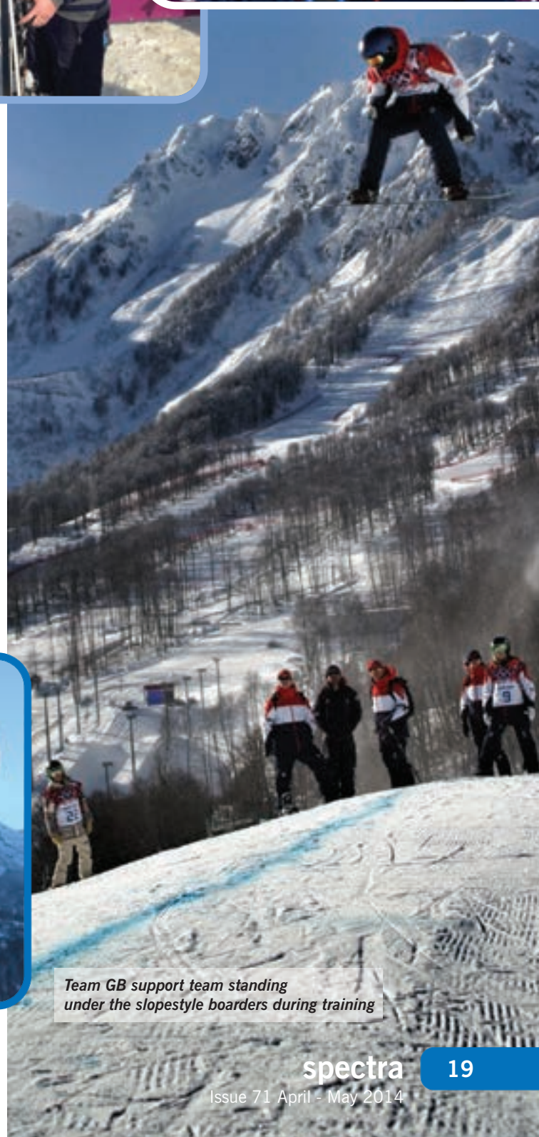
Team GB support team standing under the slopestyle boarders during training