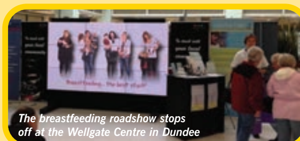
The breastfeeding roadshow stops off at the Wellgate Centre in Dundee

"We also want to let people know about the Healthy Start Scheme which provides vouchers to spend on fresh and frozen fruit and vegetables, milk and infant formula and also provides free vitamins for pregnant and breastfeeding women and children up to four years of age."