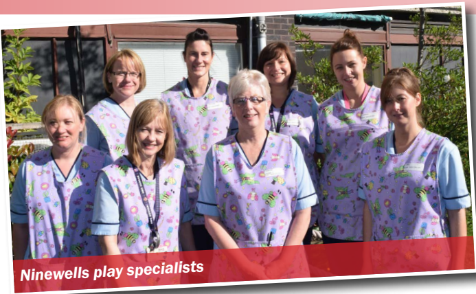
Ninewells play specialists