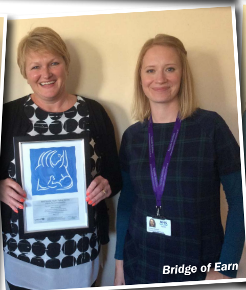
Bridge of Earn