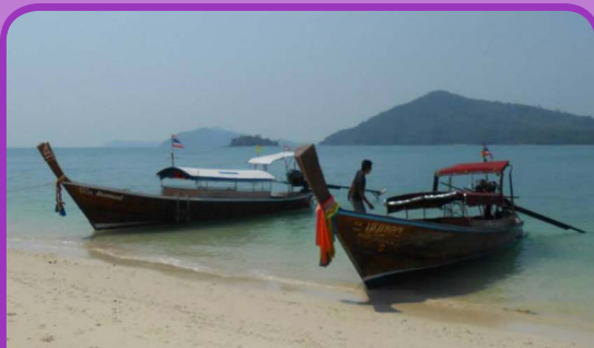
On honeymoon in Thailand

I always wanted to be a vet but I soon changed my mind as I am too squeamish! If I wasn't working in communications, I would love to write children's books or go round the world as a travel writer.