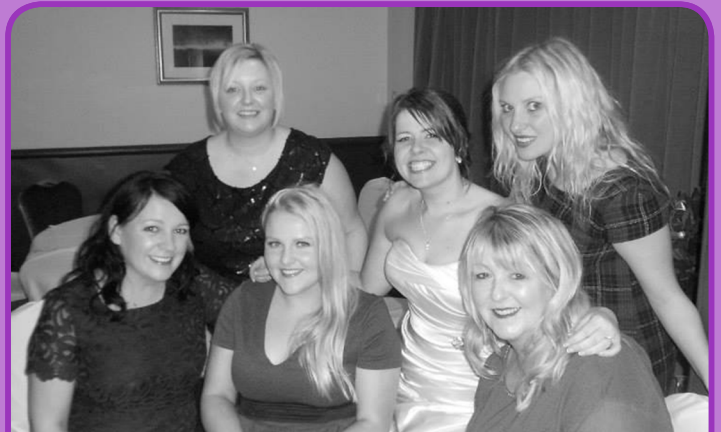
With Communications colleagues at her wedding