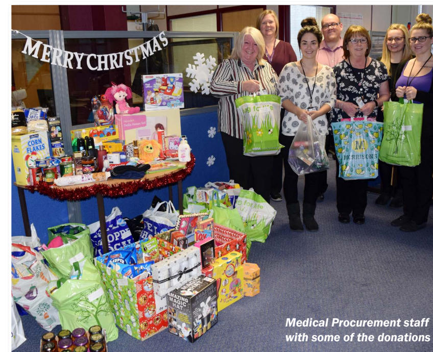
Medical Procurement staff with some of the donations

Members of Dundee Biker's Forum stopped off at Glenlaw House to hand in donations during their annual Santa Toy Run around Dundee.