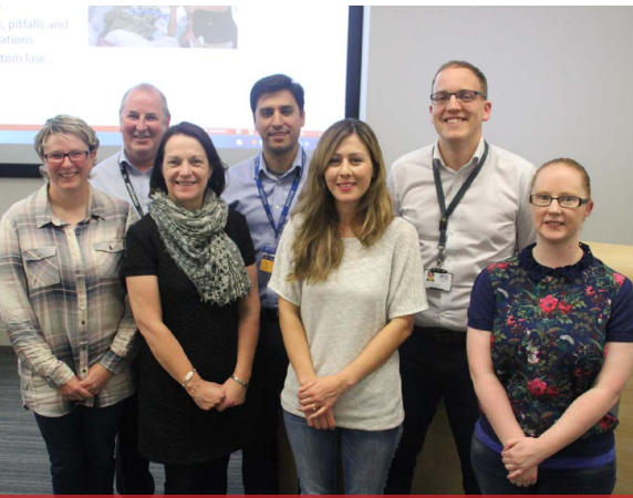
Speakers at the event