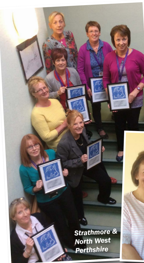
Strathmore & North West Perthshire

The Baby Friendly Award is a worldwide programme that recognises high standards of care provided for pregnant women and breastfeeding mothers and babies by community teams across the country.