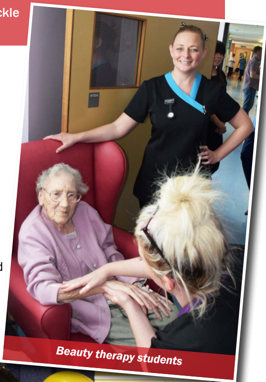
Beauty therapy students

In addition, Dundee College Beauty Therapy students visited the hospital to pamper older patients in wards 5 and 6 with hand and shoulder massages.