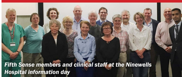
Fifth Sense members and clinical staff at the Ninewells Hospital information day