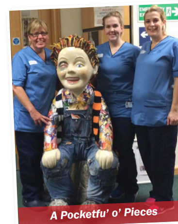
A Pocketfu' o' Pieces

Staff at Roxburghe House in Dundee also fundraised to bid for one of the statues. They didn't manage to secure their own Oor Wullie at the auction but have since had a generous offer of a loan of 'A Pocketfu' o' Pieces' from its new owners at The Sands in Broughty Ferry.