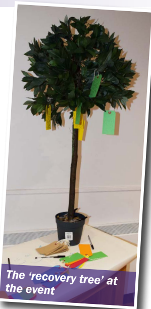
The 'recovery tree' at the event

"The members of the Tayside Drug Death Review Group will continue to closely monitor the situation and work to reduce and prevent these tragic deaths."