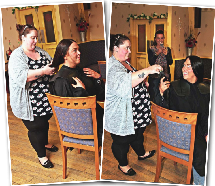
Before (left) and after the big snip!

Specialist Ultraviolet B (UVB) phototherapy equipment has been installed in Crieff and Pitlochry Community Hospitals to provide care services for patients closer to their own homes.