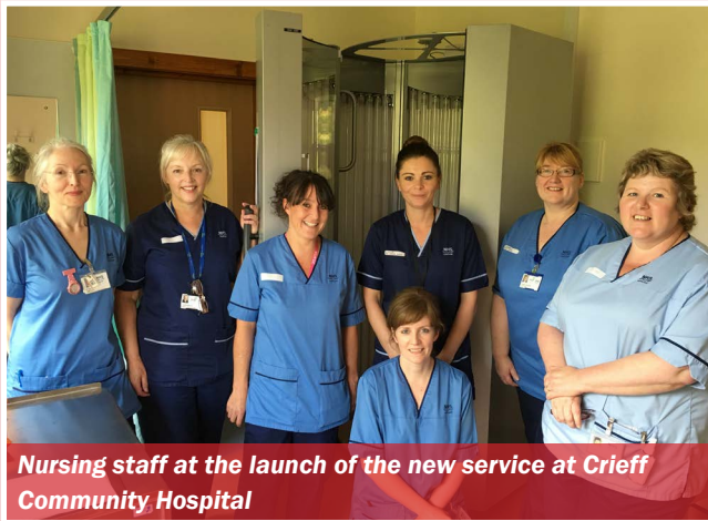
Nursing staff at the launch of the new service at Crieff Community Hospital

"We are very grateful to the Friends of the community hospitals in Aberfeldy, Pitlochry and Crieff for working in partnership with NHS Tayside to help set up this service for our patients. Their support has been invaluable."