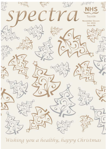
Cover illustration designed by Akdesign/FreePik

Designed and produced by NHS Tayside Corporate Communications