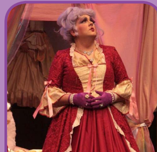
As the dame in Sleeping Beauty

Colour My World from Priscilla Queen of the Desert. The lyrics and tune are so positive and happy which is how I like to be.