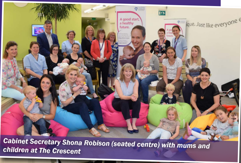
Cabinet Secretary Shona Robison (seated centre) with mums and children at The Crescent

Ms Robison also heard from breastfeeding support workers about the work that they do to promote and encourage breastfeeding.