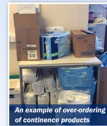
An example of over-ordering of continence products