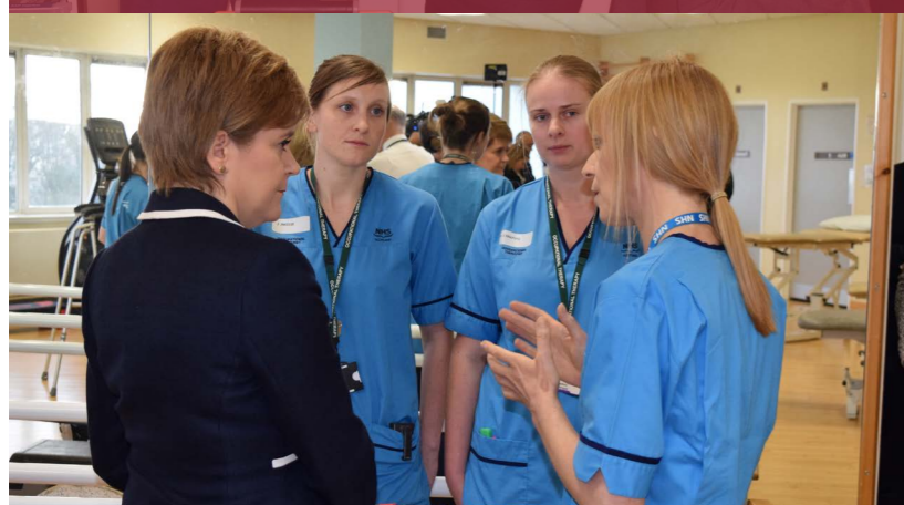
Nicola Sturgeon with AHP staff